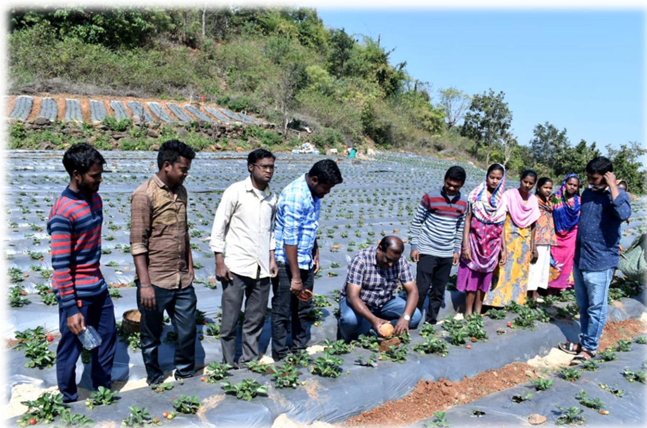
Strawberry Cultivation at Doliamba, Kotiya, under DMF